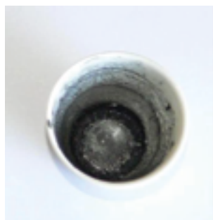
Goldenstone MTL 32